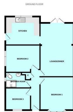
Made with Memento ©2026